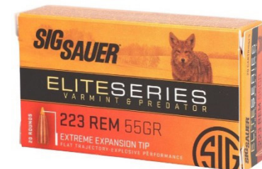
223 REM, 55GR, VARMINT AND PREDATOR